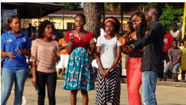
Singing group - Don Bosco Youth Centre Matadi - Monrovia

The Don Bosco Mission Office, Canada was able to support the ongoing needs of the Sean Devereux Don Bosco Youth because of your generosity. The