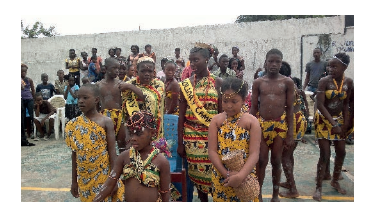
Holiday camp Monrovia-Liberia

Don Bosco aimed to foster cultures of love. He welcomed all people into his community and offered them his unconditional love. The Don Bosco Youth Centre, located in Monrovia caters to approximately 9,000