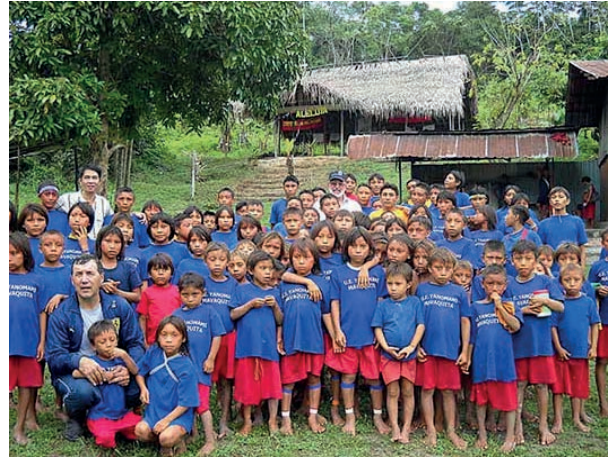
Yanomami, Alto Orinoco, VENEZUELA

The missions in Venezuela, standing by the Yanomami people, as far as possible, have acted to help transport the sick and look after them; they've provided vehicles, boats, fuel and available medicine. They provide and promote reflections, information and seek effective solutions.