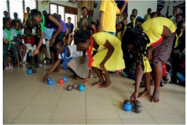
Don Bosco Holiday Camp (NIGERIA)

Funds arrived just in time to help out with summer camp in the Salesian centre in Nigeria. Thanks to you, some items were bought to help the Salesian volunteers from Krakow prepare. Three countries are coming together to serve and assist, the Canadian Don Bosco Mission Office, our Polish volunteers and the Salesians of Don Bosco in Nigeria. The impression left among the youth is always valuable, unique and educative: a clear example of generosity which will never be forgotten.